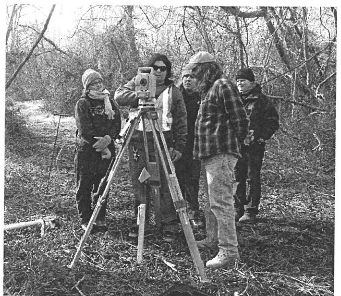
Total station transit used by Maryland State Highway Administration Survey Team and Lost Towns Project archaeologists at Curtis Creek Site.