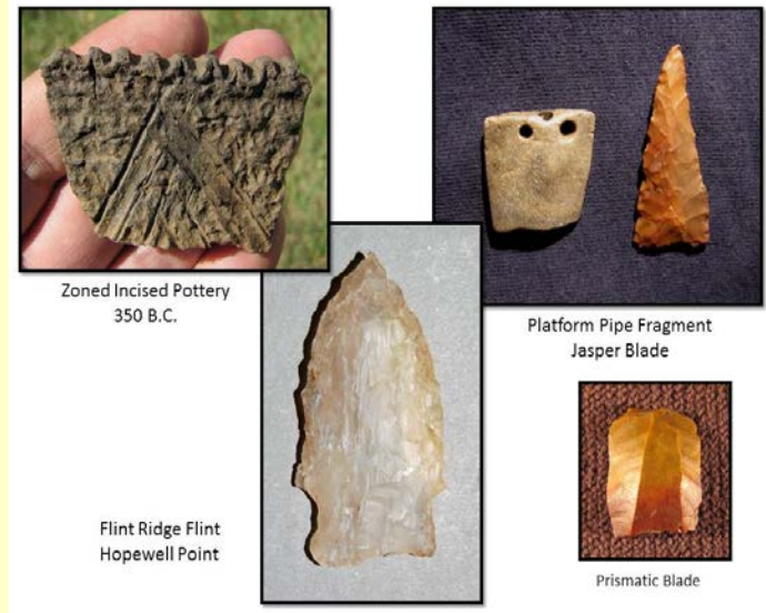
Exotic artifacts from the prehistoric Pig Point site near Jug Bay (18AN50)

http://cpmb.org/event/2018-annual-meeting-and-statewide-conference/