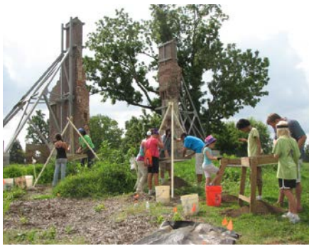
Excavations at the "Java" site - 18AN339

"Archaeology is a great hook for engaging students in order to teach them social studies content and skills."