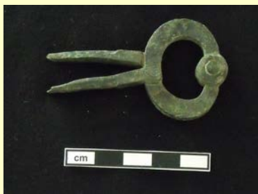
17 th Century navigational dividers from 18AN932