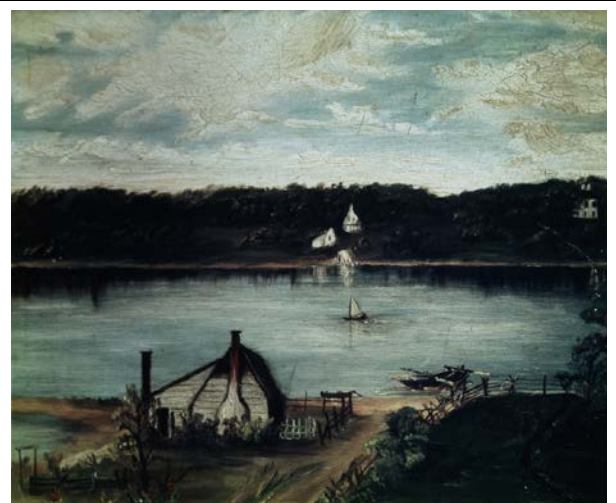
19th Century painting looking south, across the South River towards London Town and the Ferguson house and warehouse.

Online registration will be posted soon!