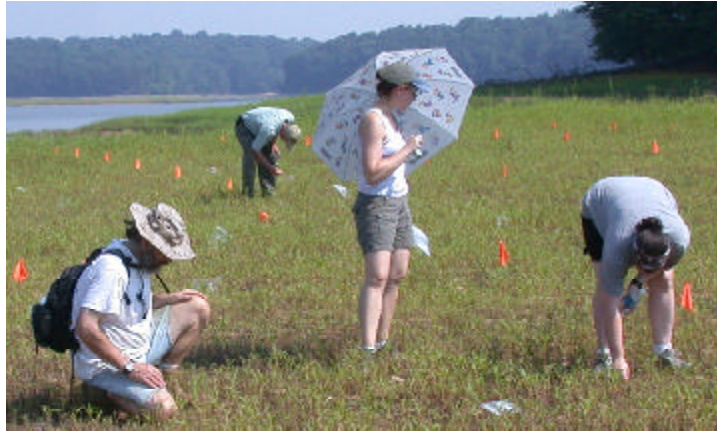
The staff and interns collecting artifacts at the Raven Site

set back by the torrential rains in late June - which put the site underwater yet again - but we're currently examining the artifacts, and will soon have a clearer insight on this homestead in what was formerly the wilderness of Anne Arundel County.