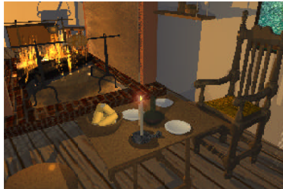
Three dimensional render of Cheney's House: Inside, by the fireplace

The opportunity to uncover areas surrounding the homestead's post-in-ground "footprint," which was thought to be roughly 20 x 26-feet, has revealed the structure was actually larger.