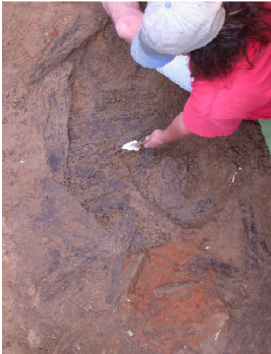
Shawn excavating the pit in the Digloo

The site is open most Wednesdays. Stop by and visit as the discoveries continue.