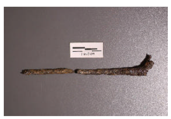
The pewter tobacco pipe found at 18AN1084.

tural Resource, and three major factors threaten the future of these barns. The first factor is the tobacco buyout, which has rendered these buildings obsolete. Therefore, many barns sit empty and unused, and are being demolished over time by nature and neglect. Secondly, the very things that make these barns a "Tobacco Barn": the heavily divided interiors, which are integrated into the structure itself and help to support the building, their lack of air and water tightness, and the dirt floors, do not lend these barns to adaptive reuse. Lastly, development pressures from the rapidly growing Baltimore-Washington Metro Region have pushed people further out into formerly rural land. These farms are swiftly being converted into housing developments where tobacco barns no longer have a place. In spite of these unyielding pressures and the difficult odds against the preservation of this unique resource, it is the responsibility of those interested in Historic Preservation to see that these barns are protected, and the people and culture that created them are remembered.