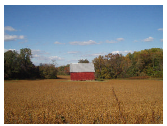
A tobacco barn stands idyllically in a wheat field in Southern Anne Arundel County.

One can't help but notice the red barns that dot the rolling landscape of Southern Anne Arundel County, with their "barn red" exteriors, silver roofs that glisten in the sun and their immense double doors that allow trucks to enter the heart of these tobacco barns. Perhaps, however, you have never entered inside this world of utilitarian perfection.