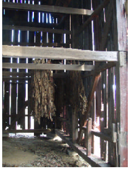
Forgotten tobacco still curing inside a barn.