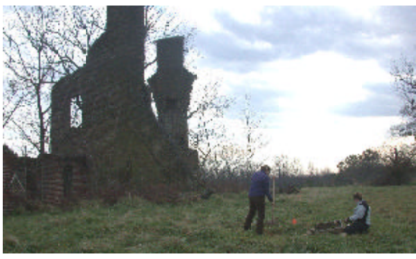
STP excavation under the shadow of Java mansion.