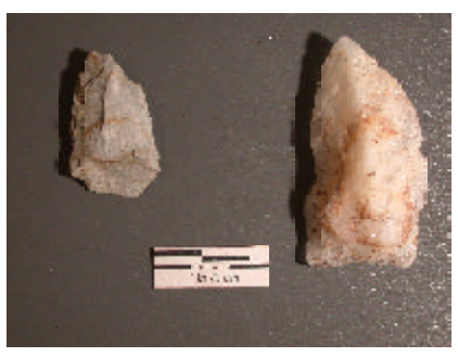
Selby Bay knives recovered in the survey.

year, the team focused its efforts upon five sites; three prehistoric sites and two historic sites, where more intensive excavations allowed us to gain a better understanding of the historic and