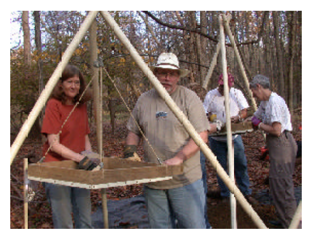
SOOOOO much more fun than the gym!

We have come up with an Archaeology Calorie-Counter© to make your physical efforts with us measurable. All numbers given are based on 30 minutes of exertion by a 150-lb. person. Obviously, the calories you burn vary depending upon your weight, height, gender, and level of effort.