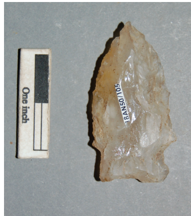
Hopewell projectile point discovered at the Pig Point site.

Come out to SERC for their annual open house with hands-on activities from historical and environmental organizations in the area, including the Lost Towns Project . For more info, visit http://www.serc.si.edu .