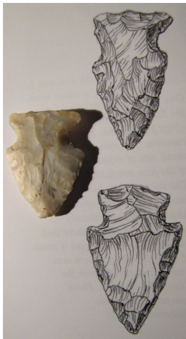
Another Hopewell point from the Johnson collection.

One of the more intriguing aspects of the Pig Point artifact assemblage is the presence of a projectile point made out of a very exotic chert (apparently from Ohio) which appears to be a resharpened Hopewell Point. If this attribution is correct, then a number of other finds at Pig Point might raise similar suspicions. Included in this list is a rolled copper bead, marginella beads, drilled canines, a zoned incised sherd, and a broken platform pipe. However, none of these are definitive by themselves or even as a group - just suspicious.