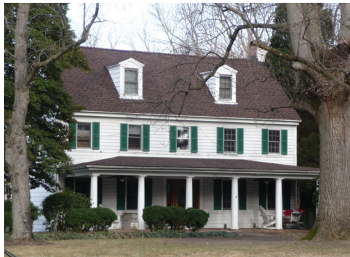
Holly Run Farm, a late-19th century vernacular farmhouse in Manhattan Beach.

The land was divided into residential building lots and sold to city residents anxious to escape oppressive summers for cool air and clear waters. The community was named