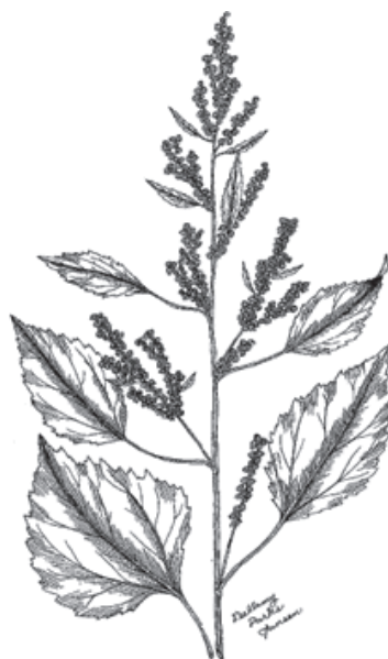
Marshelder that may have grown here in Anne Arundel County.

these standard staples did not actually come onto the scene until relatively late in the Coastal Plain environment. Early corn is not seen