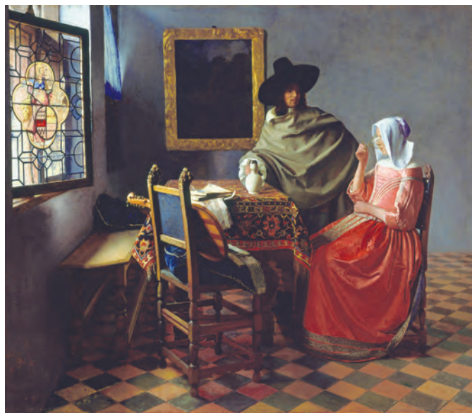
A Lady Drinking and a Gentleman by Jan Vermeer Van Delft, 1658.