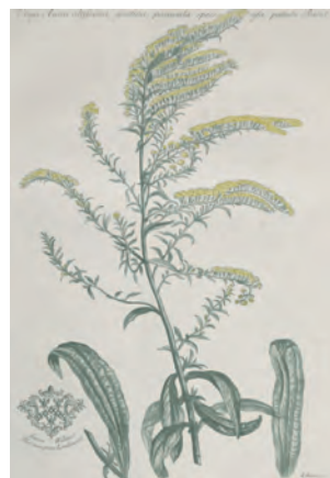
Engraving of Tall Goldenrod ( Virga aurea altissima ) in Historia Plantarum Rariorum by John Martyn, 1728.

Another important area of the exhibit conveys the experiences, customs, and cultural traditions of African and Caribbean slaves brought to London Town in the 18th century. Here you will learn about the archaeological discovery of the remains of a young child buried beneath the floorboards of the Carpenter Shop. This type of burial is based on enduring African religious traditions that were transferred and continued to be practiced in America. Powerful photos document the reburial ceremony that took place on May 8, 2003, and several news reports from that day can be seen on a video monitor.