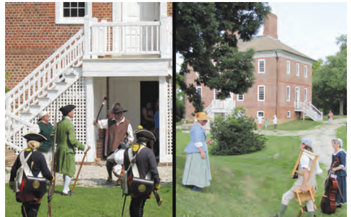
Living history re-enactors at Historic London Town and Gardens help to recreate and interpret life and events in colonial times.

By the 19th century powerful economic and political forces eventually led to the decline of the town and the Revolutionary War sealed its fate. At this point in your journey you will notice a 1795 period map showing alternate roads bypassing the town. In 1828 Anne Arundel County purchased the William Brown House and turned it into the County Almshouse for housing and feeding the poor and homeless. By the 20th century the town had largely disappeared from the landscape. Photographs and archaeological artifacts serve to document and tell the story of the Almshouse period, including its segregated African American dormitory.