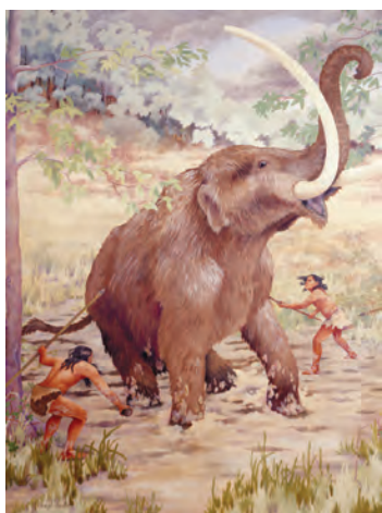
The Mastodon Hunt by Carlyle Urello.

Now installed in the lower level of the Visitor Center, Discover London Town! is designed to introduce and orient visitors to areas of the site they will later be able to fully explore, including the reconstructed Historic Area, William Brown House, and woodland and ornamental gardens. Several interpretative areas are also to be found on the building's first floor. After entering the main entrance, visitors will pass by a showcase containing the circa 1720 Mermaid Plate, now London Town's logo, followed by several very large graphics that place the town in a broad geographic context. Among the oversize depictions are the 1751 Fry-Jefferson map, a satellite view of the Chesapeake Bay, and an expansive rendering of the town by local artist Lee Boynton. The exhibit on the lower level is laid out in sections tied to specific themes. The floor plan of this space is organized in a free flowing pattern, giving visitors the opportunity to choose among various time periods and subject matter. Plan on spending as long as you like during your visit, and, until then, the following abbreviated itinerary will help to guide your travel through time.