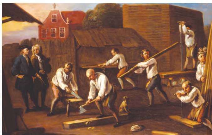
The Carpenter's Yard by Jack LaGuette, circa 1725, depicts the type of carpentry that would have taken place at William Brown's shop in London Town.

During your stay in colonial London Town, pay a visit to the circa 1725 Rumney/West Ordinary, an establishment that catered to planters, sea captains, and merchants. This area of the exhibit features an impressive reconstruction of the tavern's interior. A gate leg table is set with the same crystal wine glasses, punch bowls, and plates that Lost Towns Project archaeologists excavated from a trash pit in the tavern's cellar. Two large display cases on either side of this scene contain many more examples of glass ware and decorated Delft vessels recovered from the site. Further enhancing this experience is a virtual reconstruction of the tavern in 3D, which is accessible on an interactive touch screen monitor. Adding to the realism is an audio sound dome that plays beautiful period music by the renowned Baltimore Consort, as well as the sounds of rum punch, wine, and coffee being poured into vessels and embers crackling in the tavern's fireplace. This program was created by professional animators Carl Gehrman and John Kille.