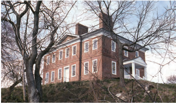
View of William Brown House looking upward from historic Scott Street.

This section also highlights the importance of the historic gardens, and the development of the site's woodland and ornamental gardens, including London Town's beautiful signature camellia collection.