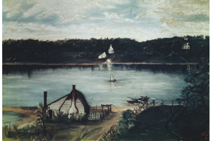
Circa 1840 painting of Ferry Point, showing London Town across the South River.