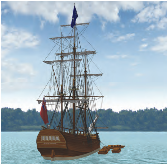
Computer reconstruction of the Rumney and Long (circa 1747) built at the William Roberts Shipyard in Annapolis.

One of the more impressive interactive displays in the Providence gallery is a huge and highly detailed world map created by Herman Moll in 1719. In this area, brilliant imagery is used to document and interpret the extensive global trading network facilitated by the Chesapeake Bay. Colorful directional lights, positioned behind the map, illuminate the navigational routes of transatlantic ships. When each path lights up, corresponding boxes containing different images of commodities traded between the New and Old World are also illuminated.