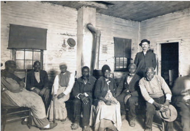
Inhabitants of London Town's African American dormitory, circa 1909.

An area of the exhibit devoted to London Town's circa 1760 William Brown House discusses the grand vision of its builder, as well as the decline of the town. This impressive, yet costly, Georgian brick building once functioned as a tavern for overland travelers. Now a National Historic Landmark, it is the last building from the town period still standing within the park. It is also the only known structure in the United States that features all header bond brick work (short end of the brick exposed) on all four walls. Why did William Brown build this monumental house? To revive London Town? To show off his wealth? To cater to elite travelers such as George Washington and Thomas Jefferson?