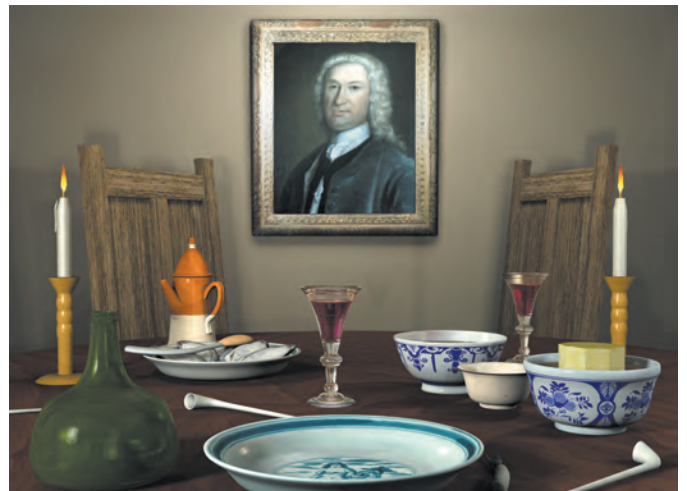
Computer reconstruction of an elegant table setting at London Town’s upscale Rumney/West Ordinary (circa 1725).