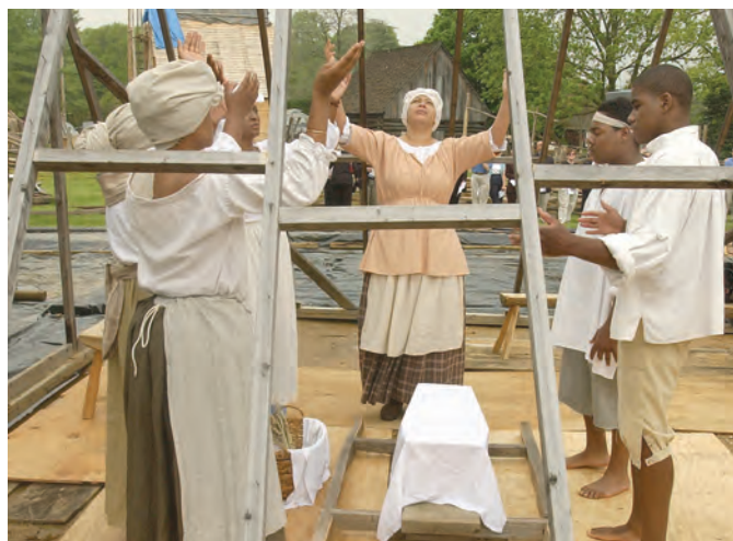
Re-enactors return the sacred remains of an African American slave child to the exact spot where a mother originally placed them three centuries ago. (Photo courtesy of J. Henson with the Capital.)

London Town's Carpenter Shop area focuses on indentured servants and tradesmen during the colonial period. Authentic period woodworking tools are on display, including a hand brace and bit for drilling holes in wood, a cooper's howel used to plane the inside of uneven barrel staves, and hoop drivers used to hammer supportive wooden hoops around barrel staves. Also showcased is an outstanding walnut chair made to resemble an 18th-century example attributed to London Town carpenter William Brown. Restoration carpenter Russell Steele constructed it entirely by hand.