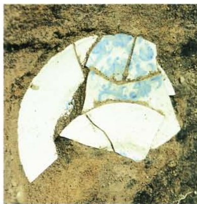
Figure 1 Sherds of the Portuguese plate as found on the cellar floor.

The short-term occupation of the site resulted in a fairly low overall artifact count. Ceramic finds included Rhenish brown salt-glazed stoneware, tin-glazed earthenware, Border ware, and redware. Interestingly, the site contained no examples of North Devon gravel-tempered earthenware, an extremely common ware type on all other Providence sites, sometimes reaching over eighty percent of the total ceramics recovered. The absence of this ceramic type is possibly due to the relatively early circa 1650 date assigned to the site’s destruction. In the course of the cellar excavation, a pile of large sherds was uncovered that had been deliberately stacked on the original cellar floor (fig. 1). These proved to be the fragments of a Portuguese