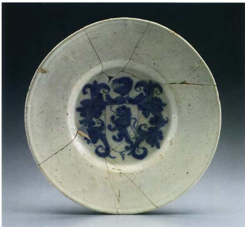
Figure 2 Plate, Portugal, tin-glazed earthenware, D. 10 3 / 8 ".